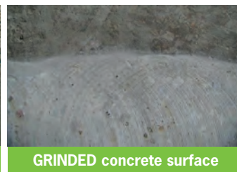
GRINDED concrete surface