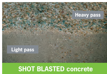
SHOT BLASTED concrete