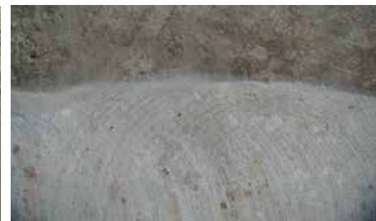
GRINDED concrete surface