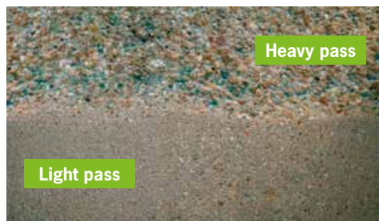
SHOT BLASTED concrete